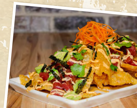
TUNA POKE NACHOS

ASIAN MARINATED CHICKEN, STIR-FRIED BELL PEPPERS, GREEN ONIONS, CILANTRO, GARLIC, SHREDDED CARROTS, RICE NOODLES, WATER CHESTNUTS, LETTUCE CUPS, PONZU SAUCE, SWEET CHILI AIOLI 12