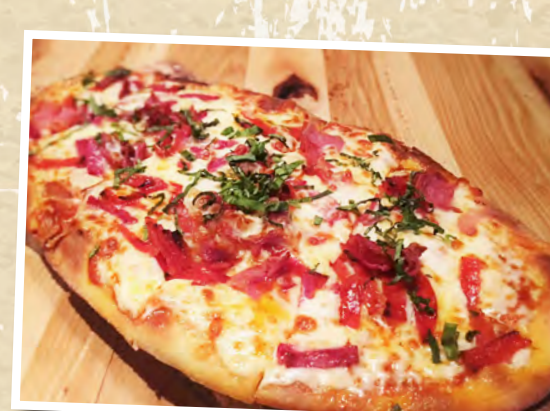
MEATLOVERS ITALIANO PIZZA

SHIITAKE MUSHROOMS, RED ONIONS, ROASTED PEPPERS, ROASTED ROMA TOMATOES, OLIVES, ARTICHOKES, ITALIAN CHEESE BLEND, FETA, PESTO SAUCE 12